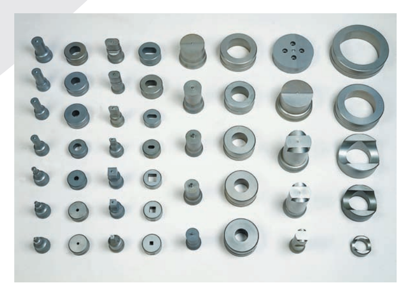
*Denotes Optional Tooling