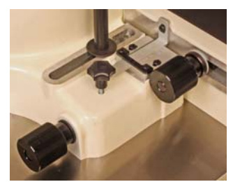
The fence system (left) is tough, stable and has all of the adjustments you need for safe, accurate shaper work. The right side fence face has this ultra-precise front-to-back control (right) for jointing-type operations.

The JET JWS-25X Shaper fence system is loaded with high-end features, beginning with the heavy-duty iron cast center section that adds a tremendous amount of stability. That casting also forms a shroud that directs the dust to a 4"-