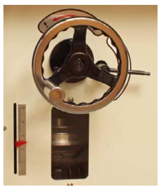
The handwheel and scale allow making precise cutter height changes quickly.

The spindles fit into a tapered seat receptacle and secured with a large locking nut. A heavy-duty draw bar pulls the spindle down into its tapered seat to be sure it is properly seated and centered.