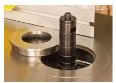
Two high-precision insert rings allow you to size the table opening to fit the cutter.

The JET JWS-25X Shaper features a 25" X 25-1/2" precision ground cast iron table that provides a durable and spacious work area. The table surface is at a comfortable 33" above the floor. The table has a full-length, full-sized (3/4" by 3/8") miter slot that accepts the included full-featured miter gauge. The slot can also be used to guide your shop-made jigs. For odd shaped jobs we include a steel starting pin that screws into threaded holes in the cast iron table.