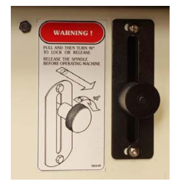
We supply a ½" and ¾"-diameter spindle with the JET JWS-25X shaper (left). Each spindle comes with a full set of spacers. Changing spindles and cutters is made easier because of this external spindle lock (right) on the right side of the cabinet.

The spindles fit into a tapered seat receptacle and secured with a large locking nut. A heavy-duty draw bar pulls the spindle down into its tapered seat to be sure it is properly seated and centered.