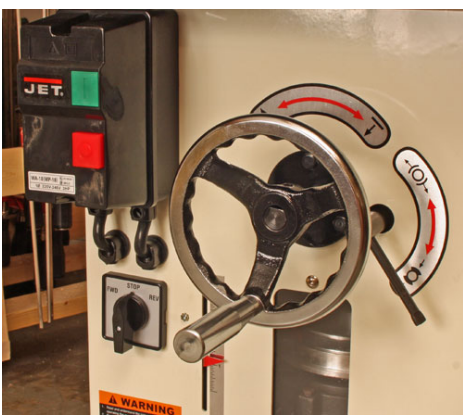
The powerful 3HP motor (left) and its mount are easily accessible through the side door. The major controls are on the front of the cabinet (right), including the magnetic switch that protect the motor and you.

The motor is controlled by a pair of switches on the front of the base cabinet. Because the JET JWS-25X Shaper motor is reversible, we added a three position switch that allows selecting forward, off or reverse.