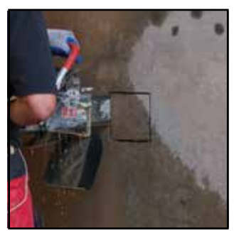
Cut squares as small as 4" x 4" (10 cm x 10 cm)