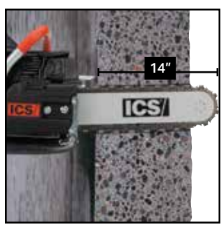
Deep cutting solution for obstructed or small openings