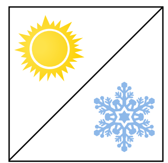
Easy-to-start in all weather