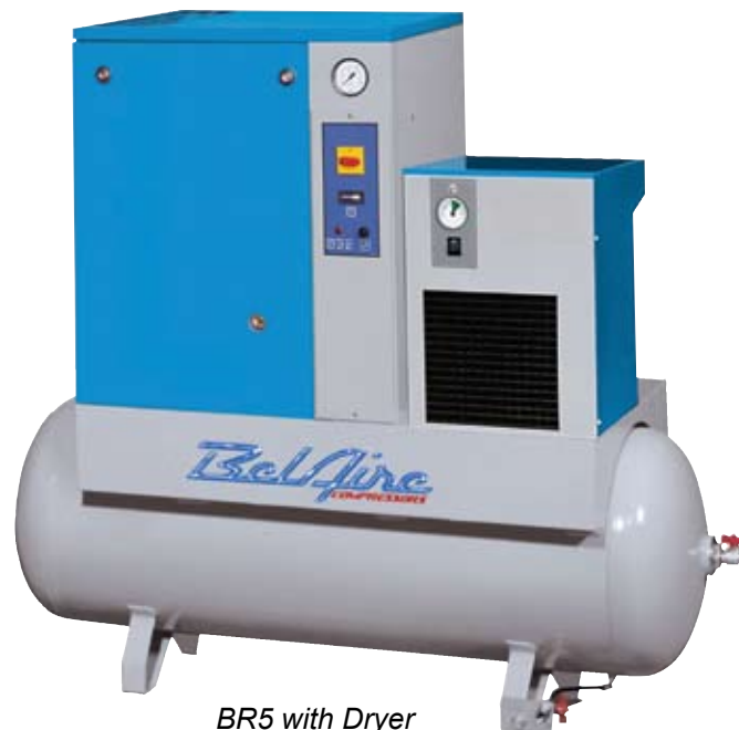
BR5 with Dryer