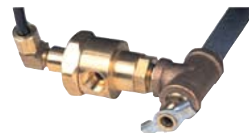
Automatic Tank Drains