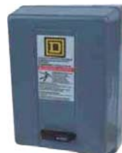
Single and Three Phase Magnetic Starters