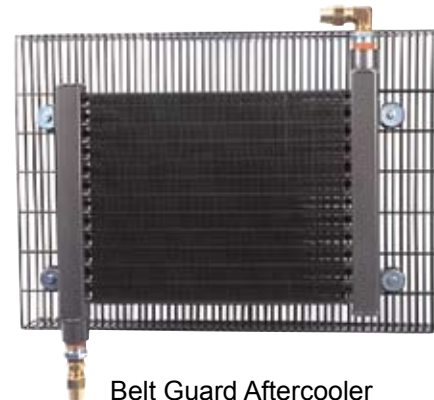
Belt Guard Aftercooler