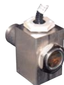
Low Oil Level Switches