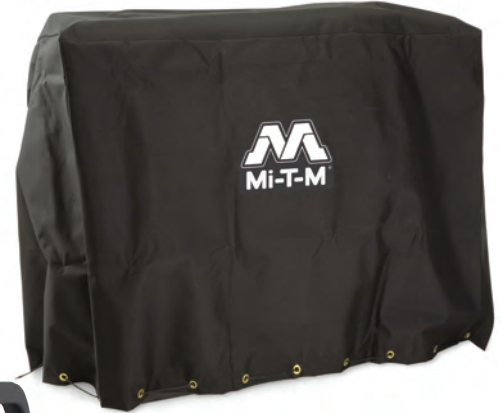
HS Series shown with optional hot water skid equipment cover (AW-6000-1006)