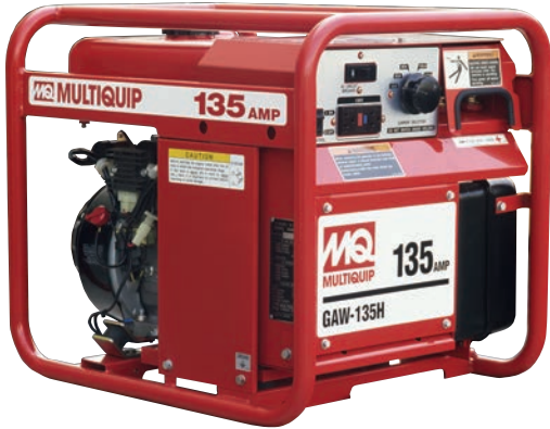
GAW135H 135 amp welder 1.5kW AC output Honda engine, recoil start

Multiquip welders deliver premium performance in sizes ranging from 135 amps to 500 amps. Whether you are looking for a gasoline-powered machine for small repairs or a large diesel-powered machine for service truck or industrial applications Multiquip has the best welders in the industry.