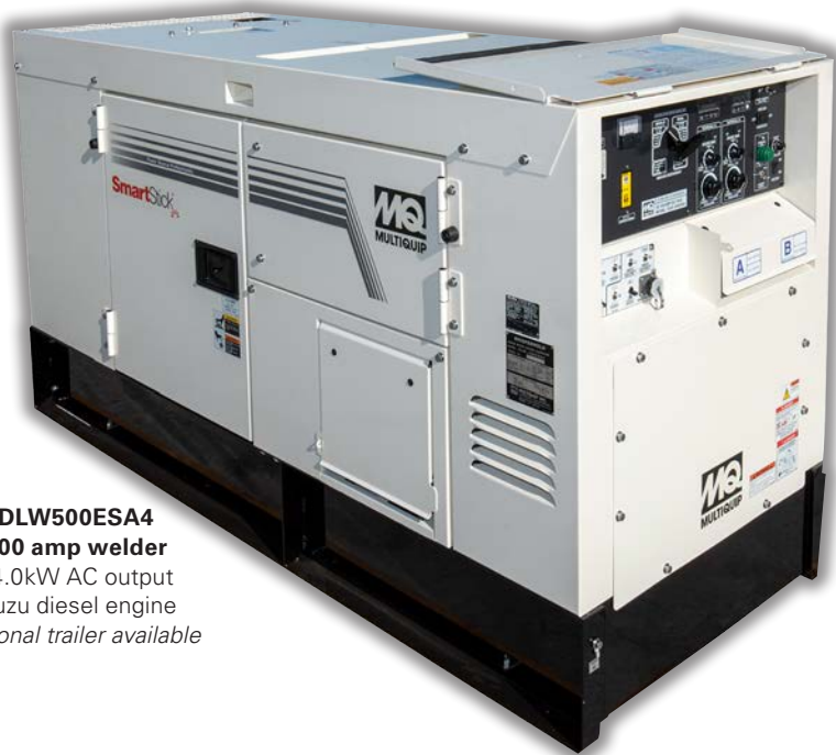
DLW500ESA4 500 amp welder 14.0kW AC output Isuzu diesel engine Optional trailer available