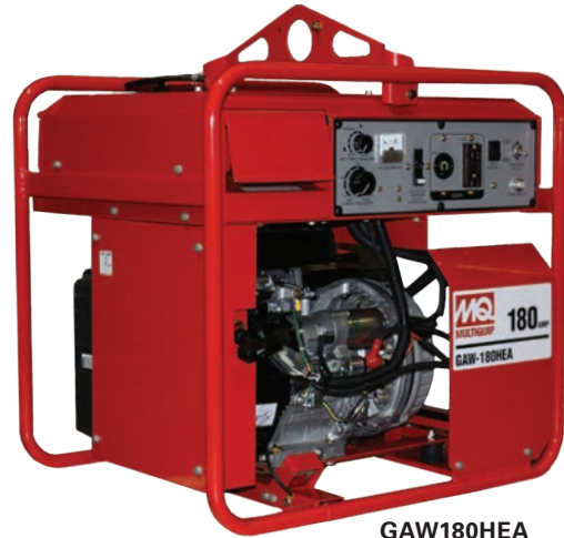
GAW180HEA 180 amp welder 3kW AC output Honda engine, recoil/electric start Battery sold separately Battery specifications: 12N243A / MQ# 0162212024