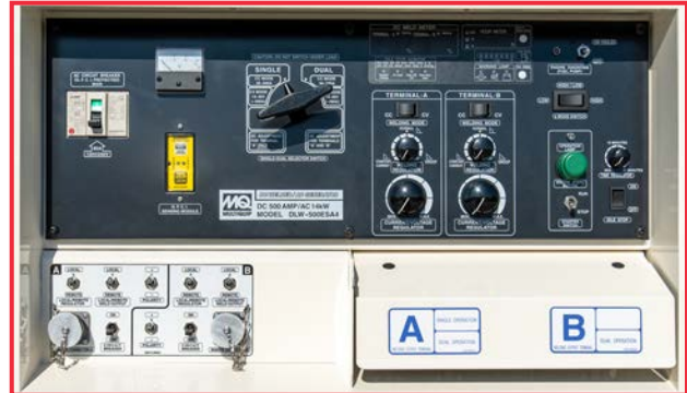
Full instrumentation is protected by a lockable cover panel. Includes DC voltage and amperage indicators for when in either CC or CV positions.