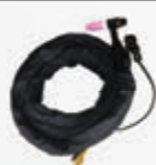
WP-26 Air Cooled 14-ft Torch