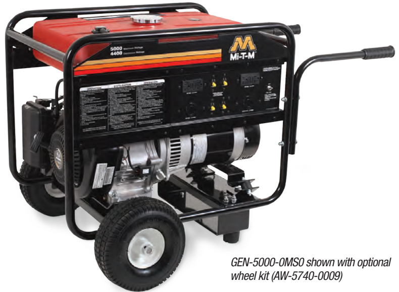
GEN-5000-OMS0 shown with optional wheel kit (AW-5740-0009)