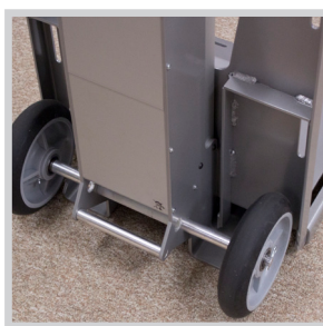
Kick axle for easy tilting of LNB-2 for load transport.