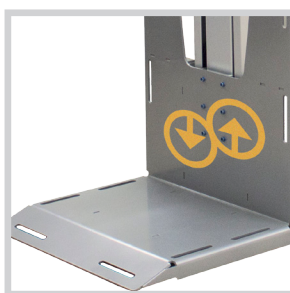
Large 20" x 16" platform with load backrest and angled lip.