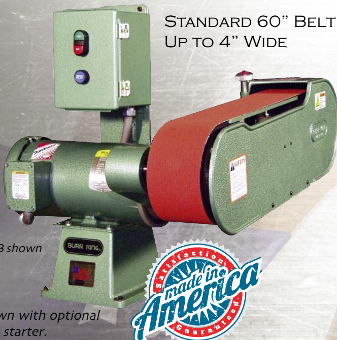
Shown with optional mag starter.