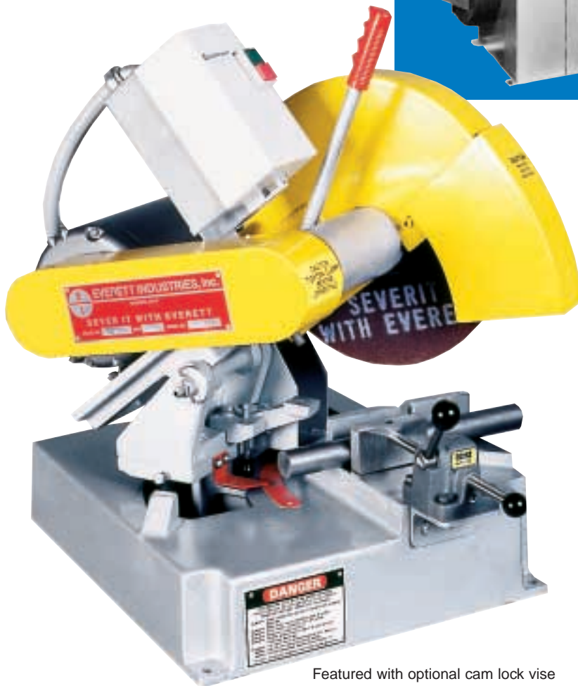
Featured with optional cam lock vise